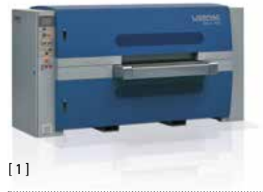
[ 1 ]